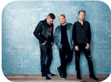
RASCAL FLATTS Thursday, February 27 7:30 p.m.