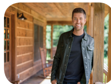
JOSH TURNER Wednesday, March 4 7:30 p.m.