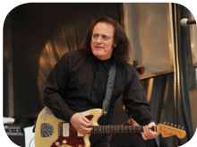
TOMMY JAMES & THE SHONDELLS Friday, February 28 3:30 p.m.