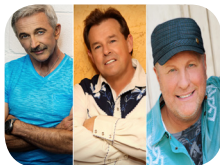
ROOTS & BOOTS- AARON TIPPIN, SAMMY KERSHAW & COLLIN RAYE Saturday, February 29 3:30 p.m.