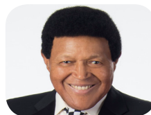
CHUBBY CHECKER & THE WILDCATS Wednesday, March 4 3:30 p.m.