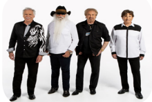
THE OAK RIDGE BOYS Thursday, February 27 3:30 p.m.