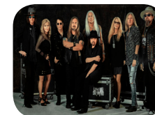
LYNYRD SKYNYRD Sunday, March 8 7:30 p.m.