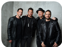
AN EVENING WITH 98 DEGREES Saturday, February 29 7:30 p.m.