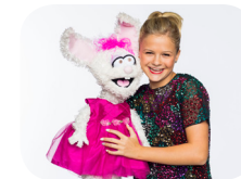
DARCI LYNNE & FRIENDS: FRESH OUT OF THE BOX TOUR Friday, March 6 7:30 p.m.