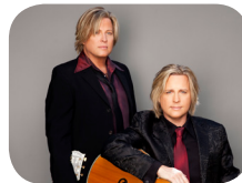
RICKY NELSON REMEMBERED (THE NELSON BROTHERS) Thursday, March 5 10:30 a.m.