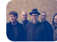
MERCYME Thursday, March 5 7:30 p.m.