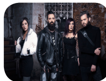
SKILLET Tuesday, March 3 7:30 p.m.