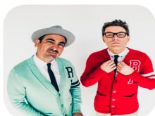
BOBBY BONES & THE RAGING IDIOTS Sunday, March 1 3:30 p.m.