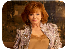
REBA McENTIRE Sunday, March 1 7:30 p.m.