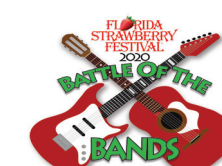
FLORIDA STRAWBERRY FESTIVAL BATTLE OF THE BANDS FINALS Saturday, March 7 3:30 p.m.