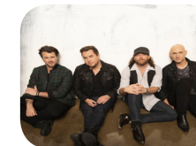
ELI YOUNG BAND Sunday, March 8 3:30 p.m.