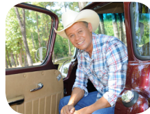
NEAL MCCOY Monday, March 2 3:30 p.m.